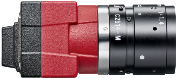
Model without hardware options