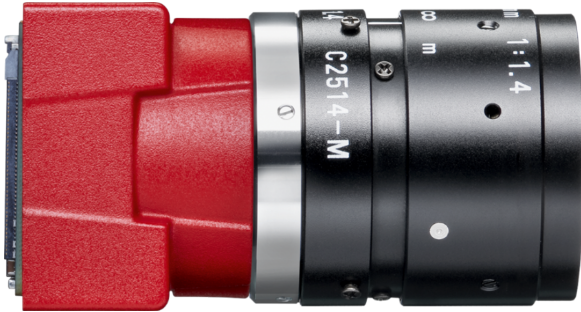
Model without hardware options