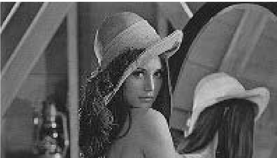
Figure 3: The same image after DPC correction has been applied

The same image after the DPC has been applied is shown below: