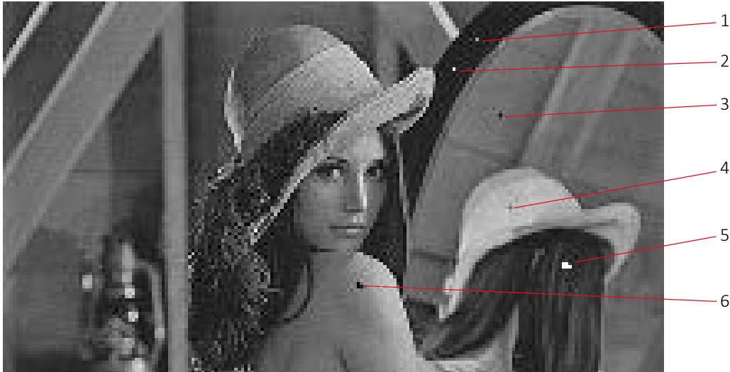
Figure 2: Example image showing various pixel defects

The following example show various pixel defects: